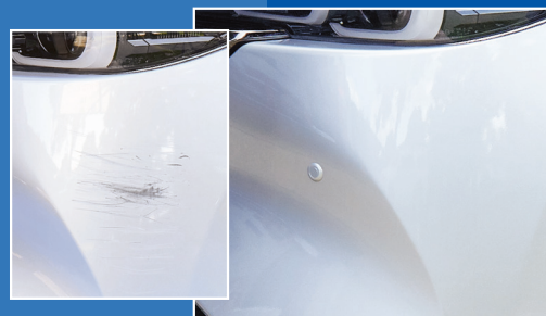
Bumper Bar Scrapes & Scratches