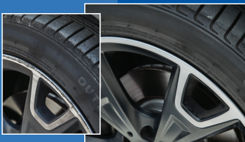
Alloy Wheel Scrapes